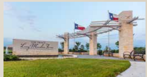
New Prairie Park Nature Area